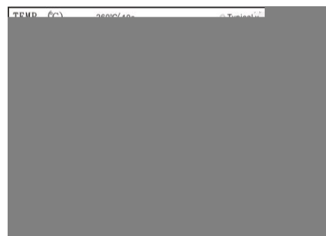
Wave Soldering (Flow Soldering)